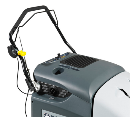
Convenient transport and storage: Handlebar completely foldable.