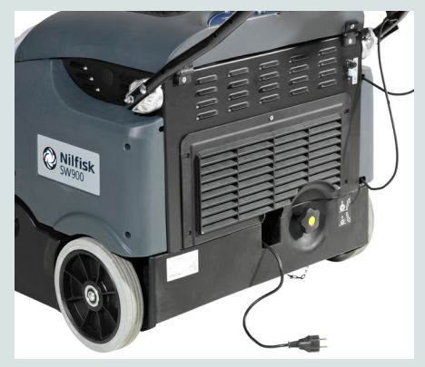
The battery version of Nilfisk SW900, for both in- and outdoor sweeping, has an onboard charger as standard