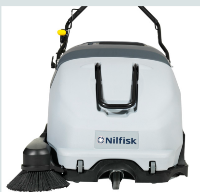
Good hygiene: Hands of user will only touch clean parts of hopper when dumping the debris.