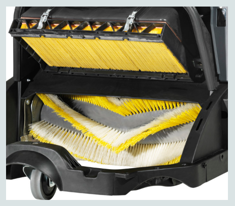
Time-saving maintenance: Broom change, and other maintenance tasks, can be carried out without tools