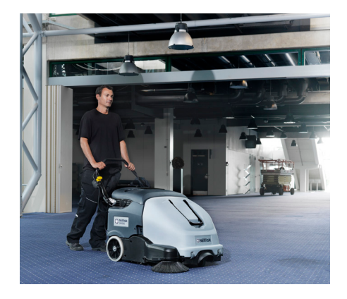
Removes even the smallest particles – also on carpet areas.